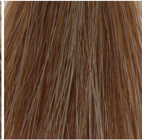
Flaxen Sorrel Horsehair