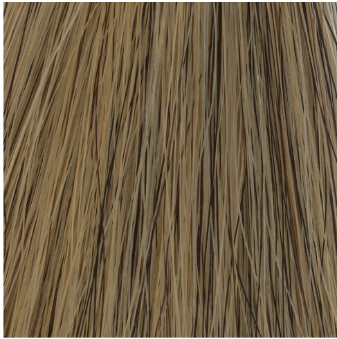
Light Silver Horsehair