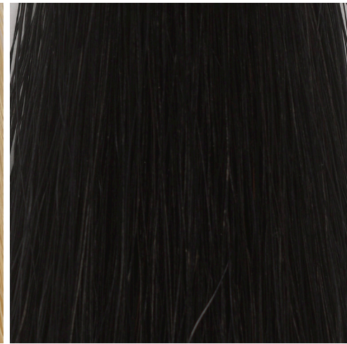
Jet Black Horsehair