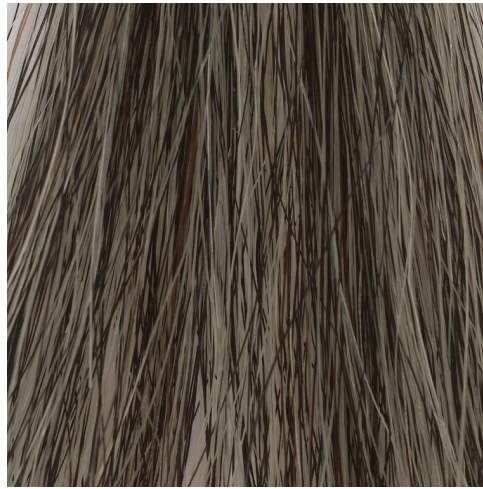
Medium Silver Horsehair