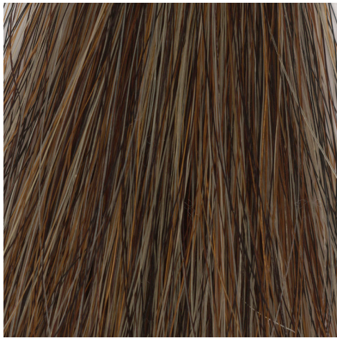
Dark Flaxen Sorrel Horsehair