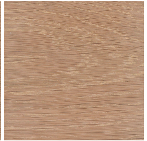
White Oil Oak