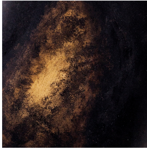
Blackened Steel with Brass Detail