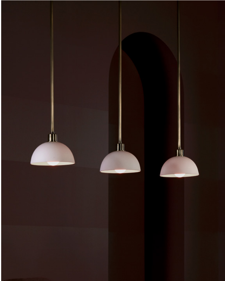
AGED BRASS / PORCELAIN