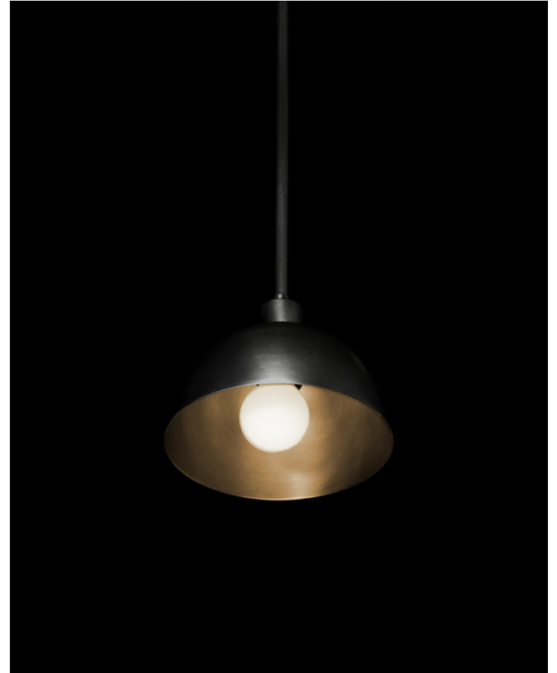
AGED BRASS / TARNISHED SILVER