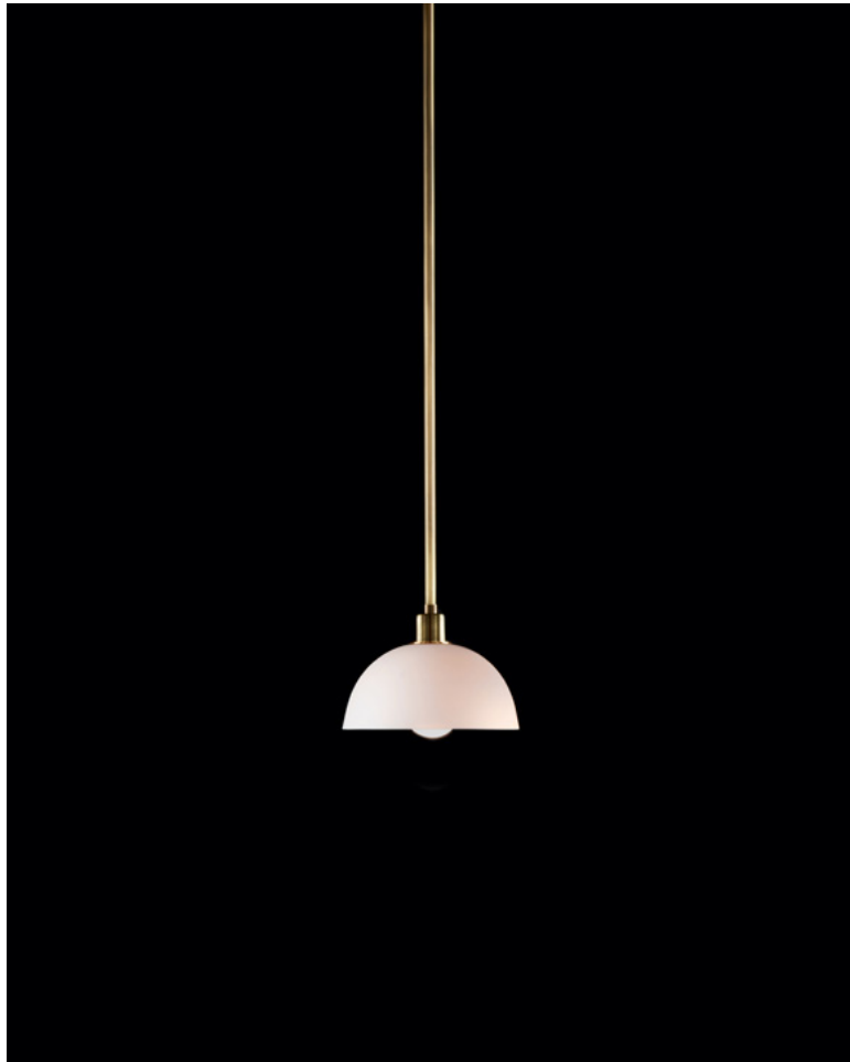
AGED BRASS / PORCELAIN