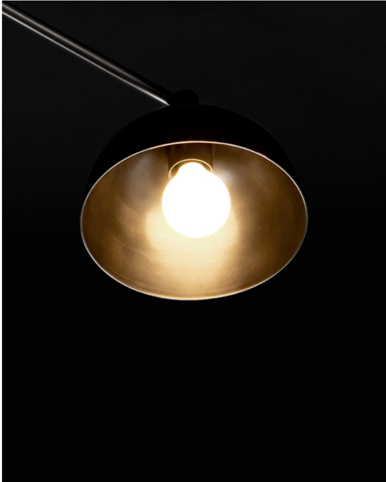
AGED BRASS / BLACKENED BRASS