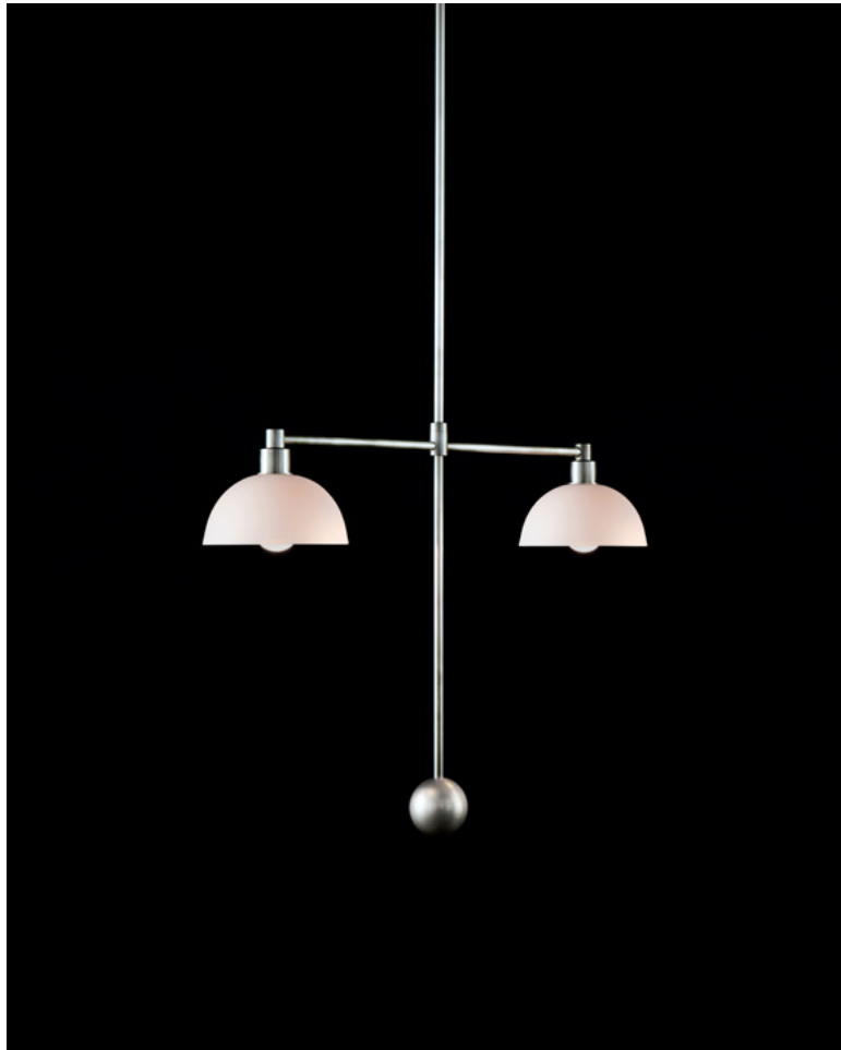
TARNISHED SILVER / PORCELAIN