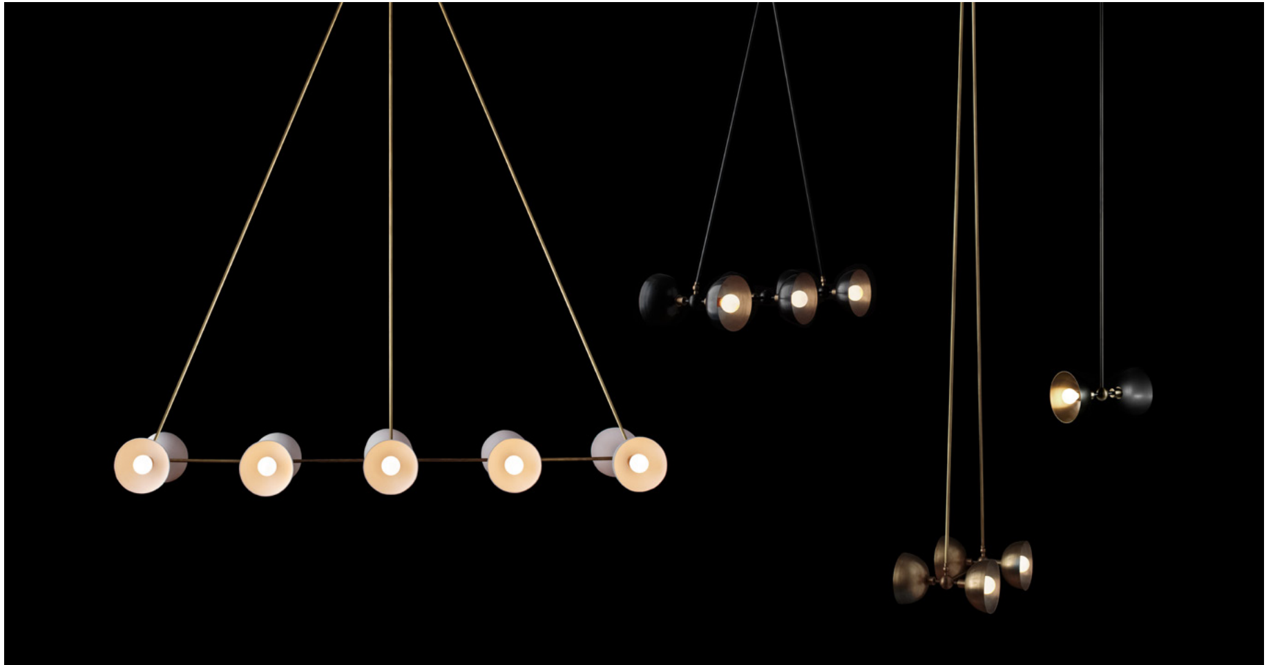
AGED BRASS / PORCELAIN