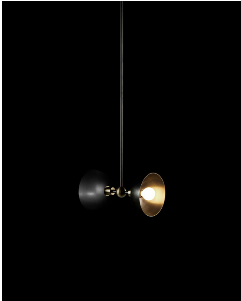
AGED BRASS / BLACKENED BRASS