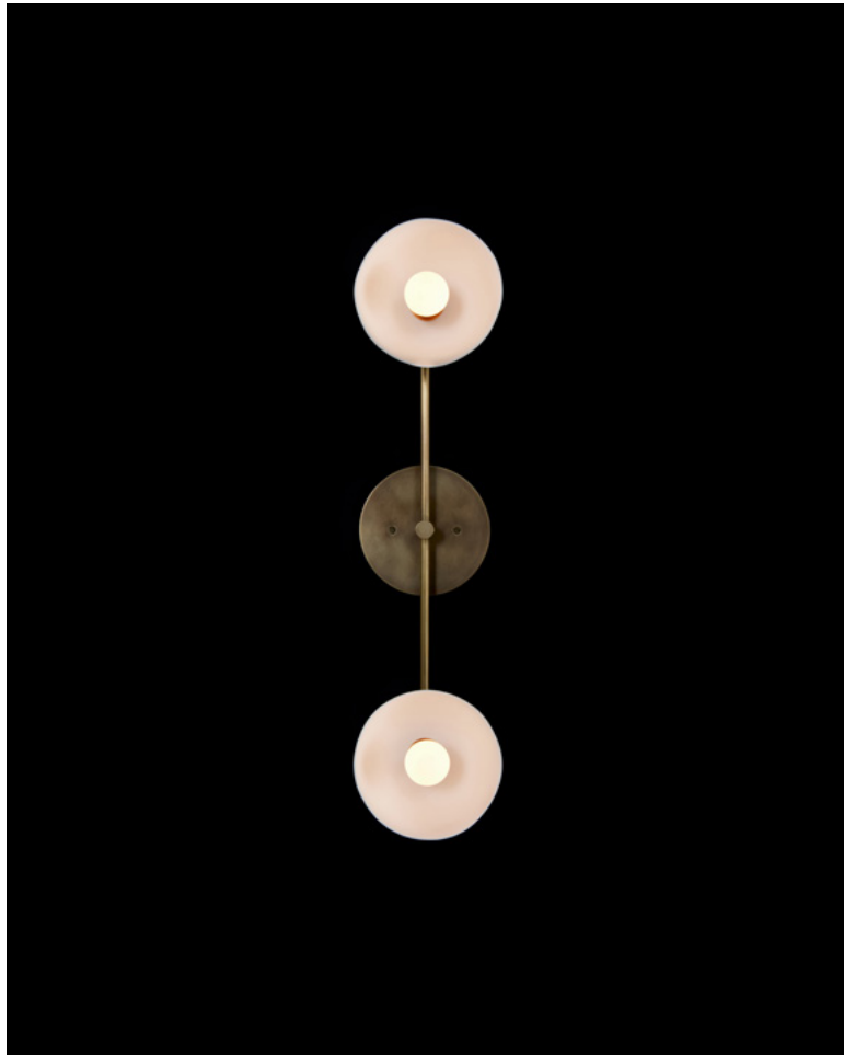
AGED BRASS / PORCELAIN