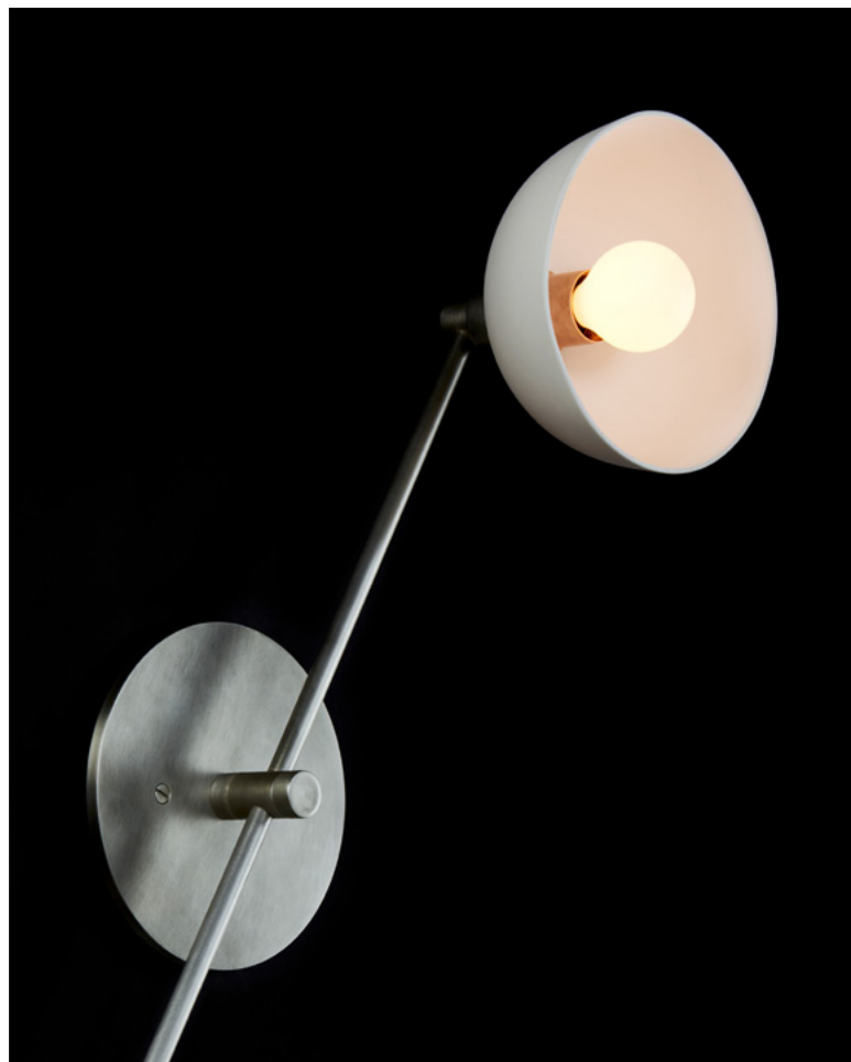
TARNISHED SILVER / PORCELAIN