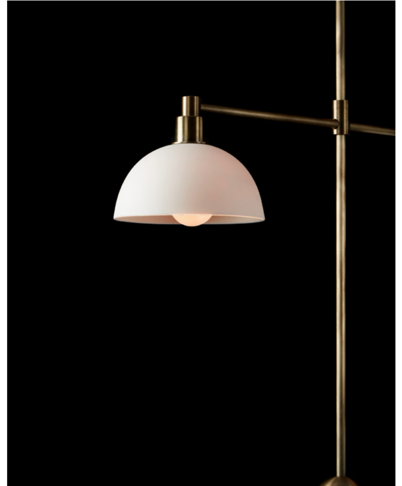
AGED BRASS / PORCELAIN