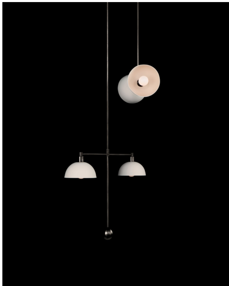
BLACKENED BRASS / PORCELAIN