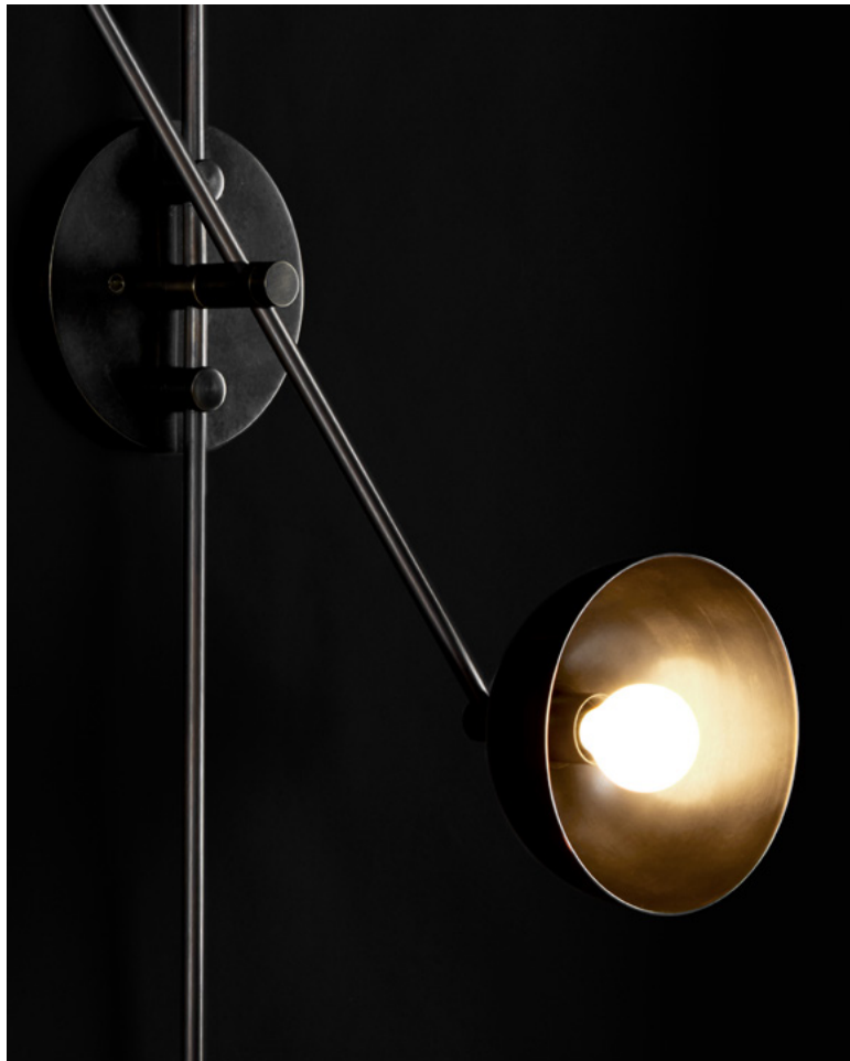
AGED BRASS / BLACKENED BRASS