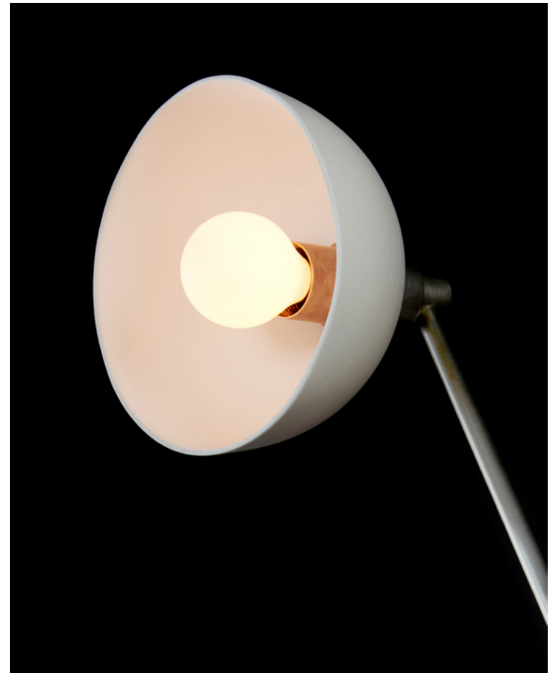
TARNISHED SILVER / PORCELAIN