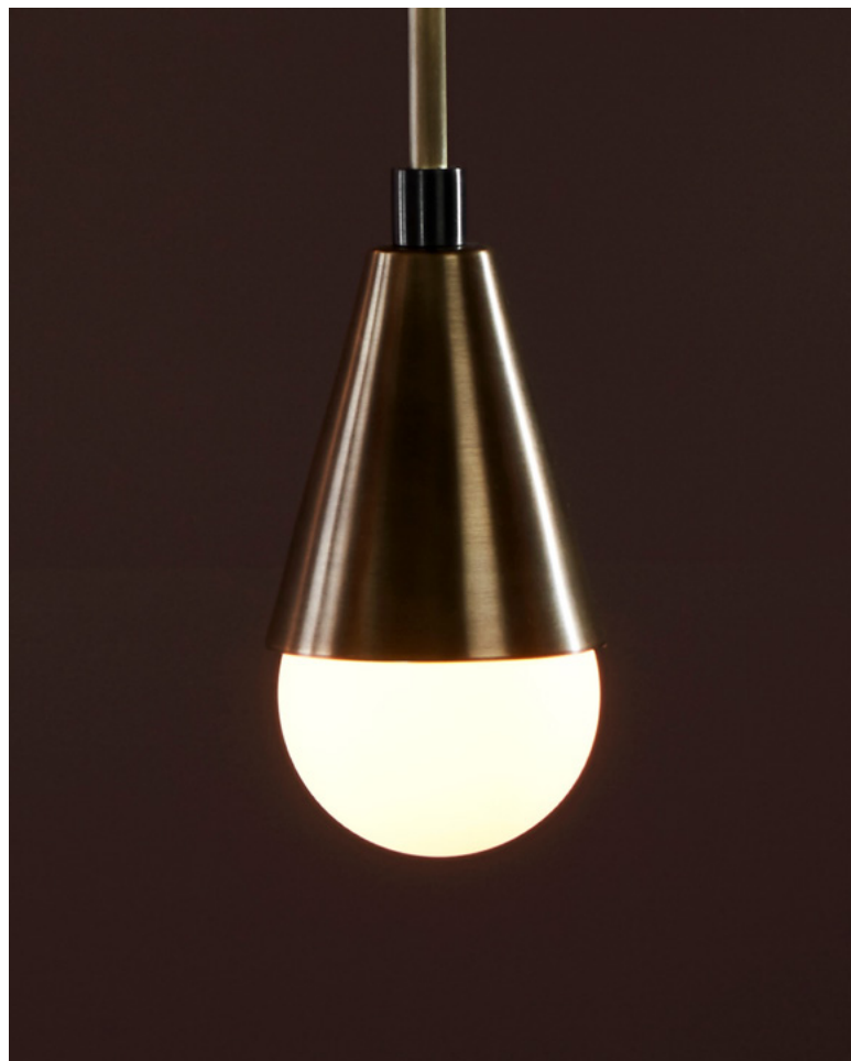
AGED BRASS / BLACKENED BRASS