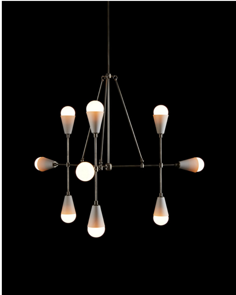
AGED BRASS / PORCELAIN