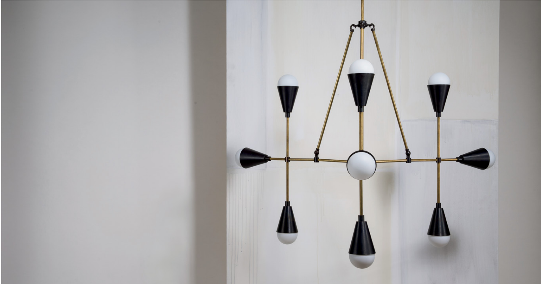
AGED BRASS / BLACKENED BRASS