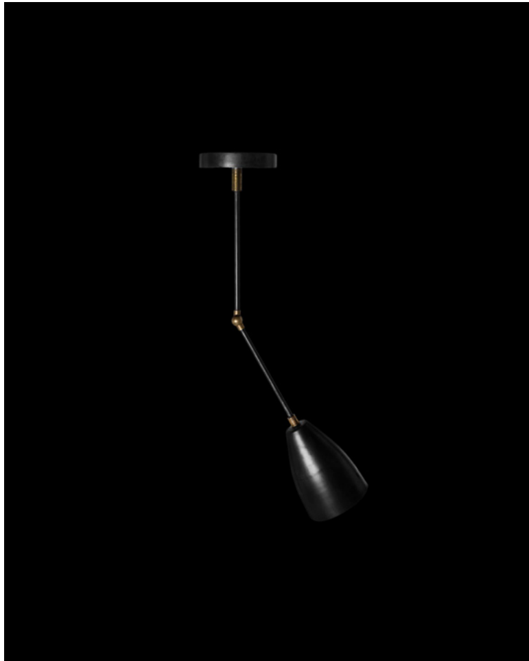
BLACKENED BRASS / AGED BRASS