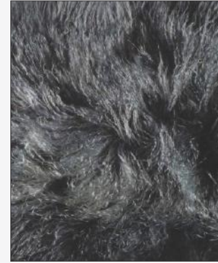
C03 MONGOLIA GRAY