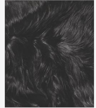
C04 MONGOLIA BLACK