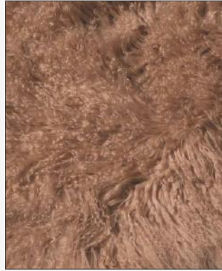
C02 MONGOLIA BEIGE